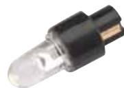
Replacement Sirona LED Bulb PN 9373